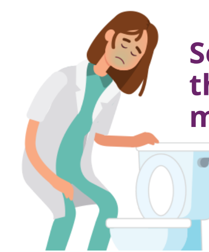
Severe nausea and throwing up (not like morning sickness)