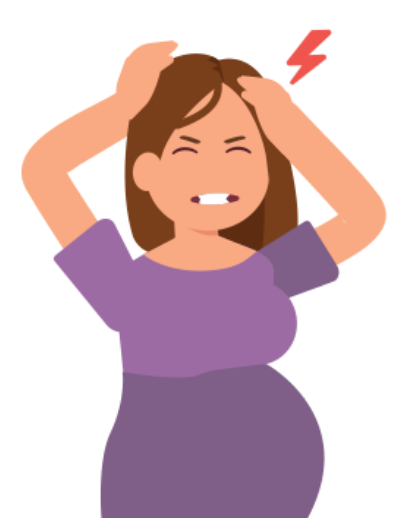
Headache that won't go away or gets worse over time