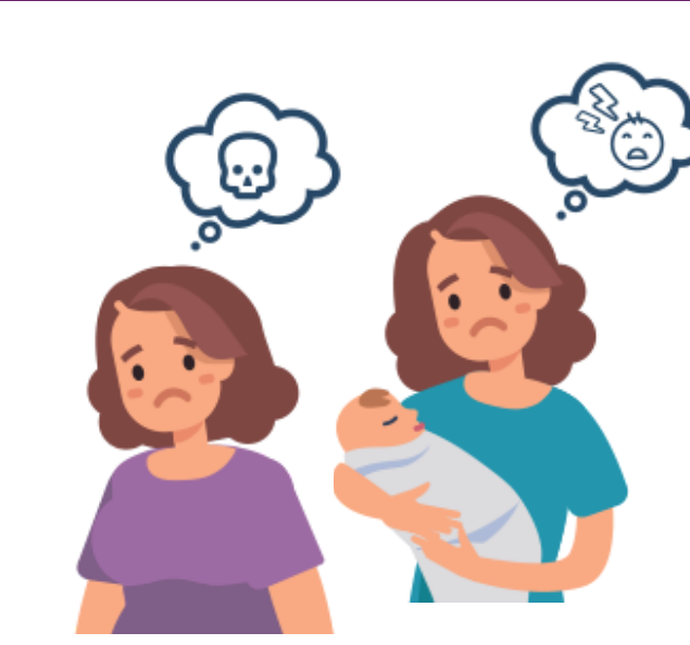
Thoughts about hurting yourself or your baby