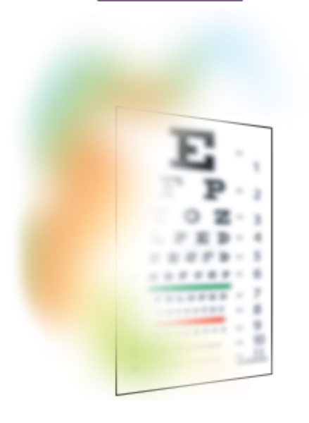
Changes in your vision